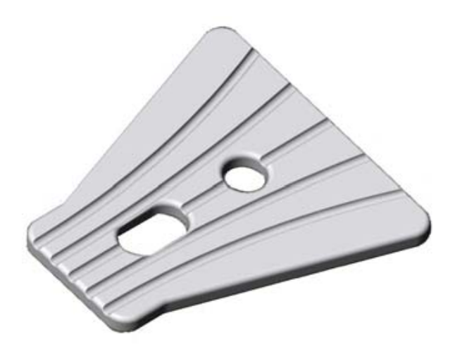
Fig. (1). Hema implant model. (V-2000, Esnoper<sup>®</sup>, AJL Ophthalmics, Álava, Spain).

technique firstly described by Mermoud [9] with the use of MMC. The hema implant (V-2000, Esnoper®, AJL Ophthalmics, Álava, Spain) (Fig. 1) was placed in a full thickness scleral pocket, made with a 45^{\circ} blade for the incision and a blunt spatula, 2mm behind the scleral spur and sutured with a 10/0 nylon suture (Fig. 2).